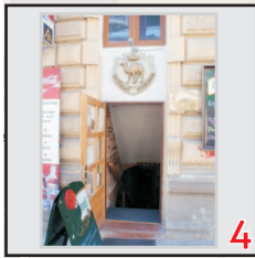
Uctíváný velbloud Americká 20