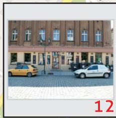
Potrefená husa Martinská 1