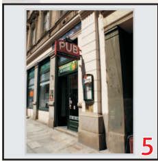
The PUB II Pražská 1