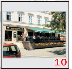
U Mansfelda Dřevěná 9