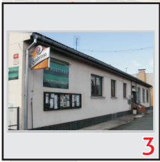
Na potravinách Radčická 4