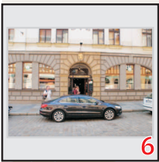
U Salzmannů Pražská 8