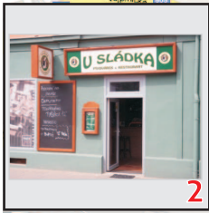
U Sládka Poděbradova 12