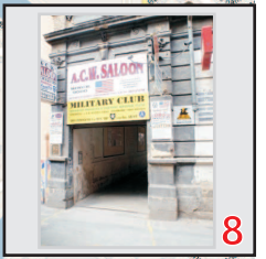
A.C.W. Saloon Kollárova 18