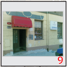
KMP - Hamburg Nádražní 16