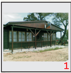
U Darebáka Dobřanská 21