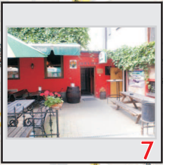
Zach's Pub Palackého nám. 2